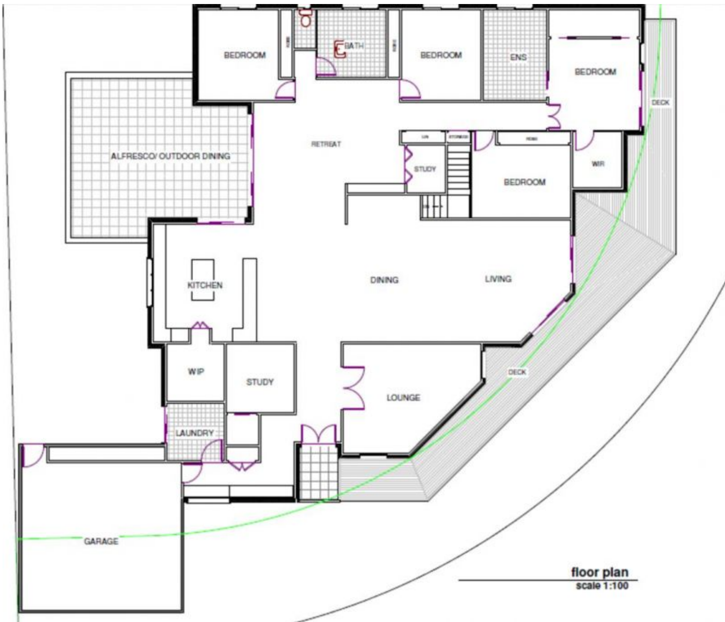
floor plan scale 1:100