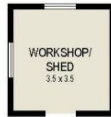
(NOT IN POSITION)