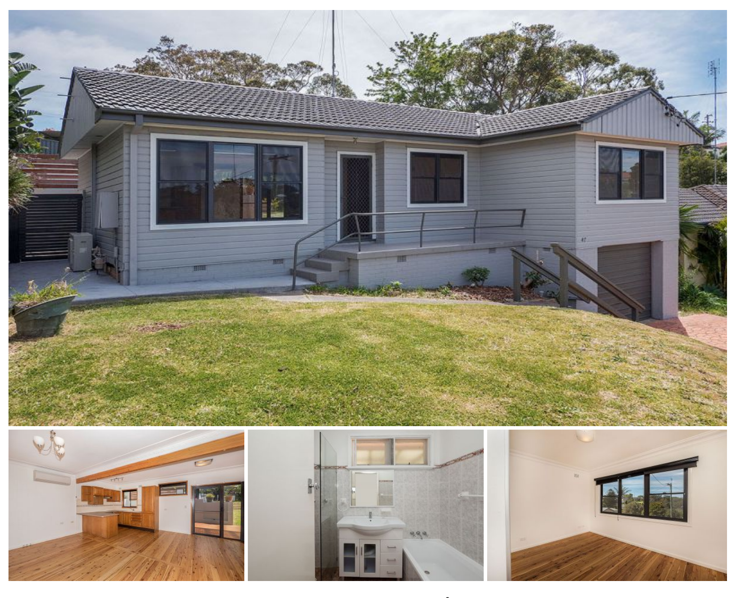
47 Caldwell Avenue Dudley NSW

Renovated from top to toe, this neat as a pin 3 bedroom home is ready for tenancy. Offering a private deck, large in ground swimming pool, beautiful landscaped surroundings for pure entertainment, polished timber floor boards, built ins located in each bedroom, lock up garage & air conditioning.