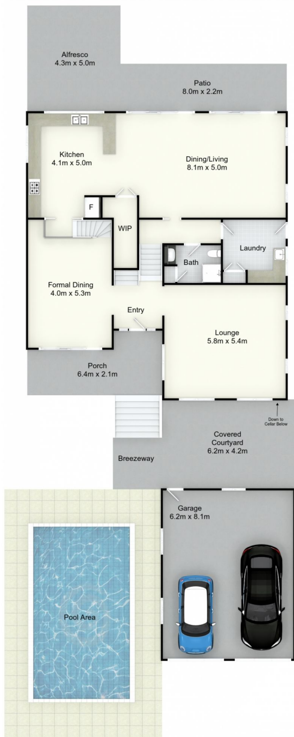
Lower Split Level